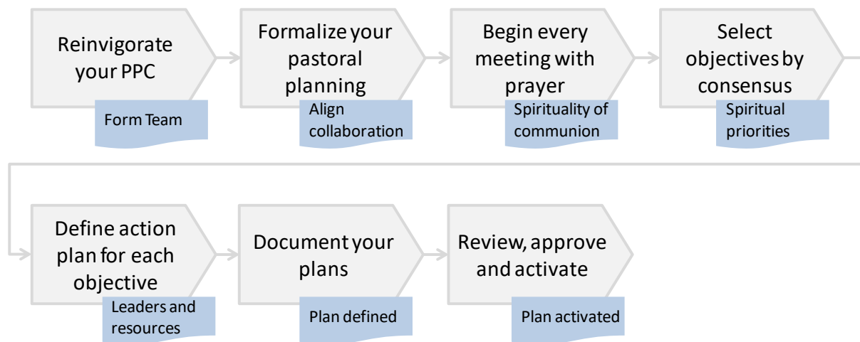
Figure 2. Planning Steps

Once your plan is ready, we kindly ask you to share with us of your Parish Action Plan & Tracking form 1 . By email, to pastoralplan@archgh.org , or by fax to 713-652-4486 or by mail to Secretariat for Pastoral and Educational Ministries, 2403 Holcombe Blvd., Houston, TX 77021.