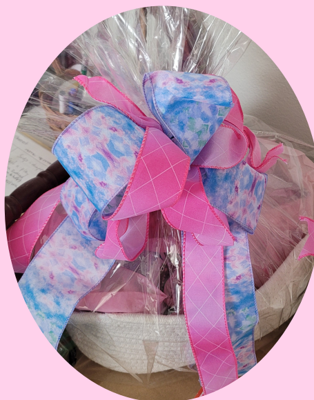
This is a sample basket for our Gabriel Project, donated by seniors.