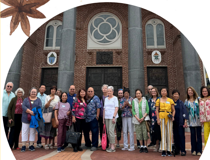
St. Anthony Cathedral Basilica in Beaumont